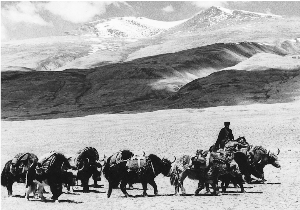
FIGURE 1 International development agents provide humanitarian aid to the Kyrgyz of the Little Pamir in Afghanistan. Humanitarian aid is loaded onto yaks and brought to remote grazing grounds. To support such development activities and contribute to sustainable living conditions, research must develop the means to assess complex political, social, environmental, and cultural realities. (Photo by H. Kreutzmann, June 2000)

exploitation of natural resources are underestimated as the driving forces of human habitat systems in high mountain regions. This also applies to socioeconomic relations between highlands and lowlands.