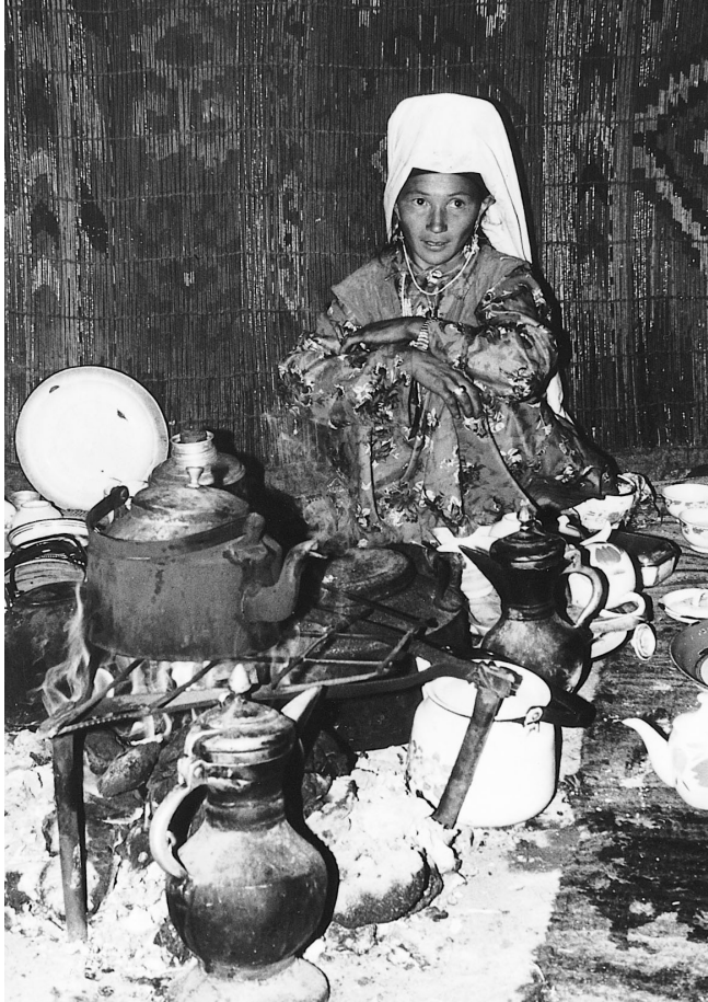
FIGURE 2 Kyrgyz nomads in the Little Pamir (Afghanistan) belong to remote groups in high mountain regions who depend to a major degree on self-sufficiency but sometimes still rely on external aid for survival.

tistical aggregation provides insight into the level of development in nation-states that contain mountainous regions.